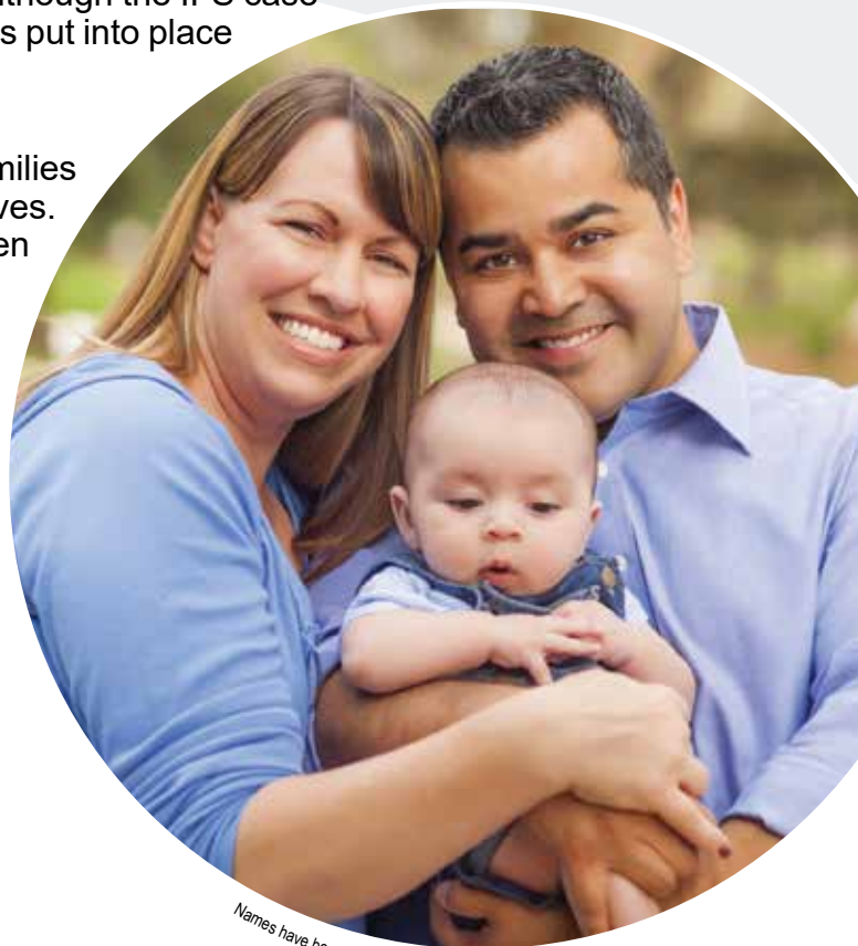
Names have been changed and photo is for illustration only

It is an incredible privilege to come alongside families when they are struggling with challenges in their lives. We are encouraged to see positive changes when families are strengthened and remain together.