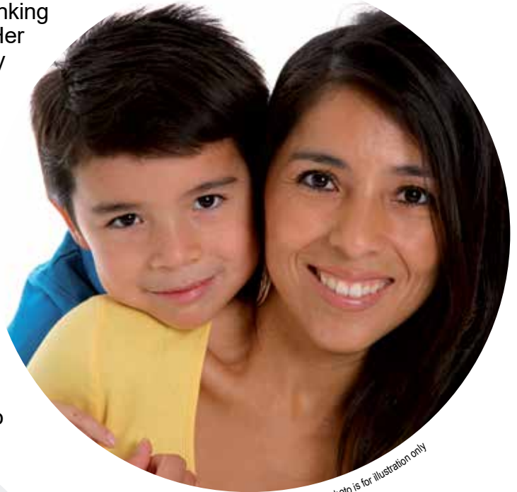
Names have been changed and photo is for illustration only