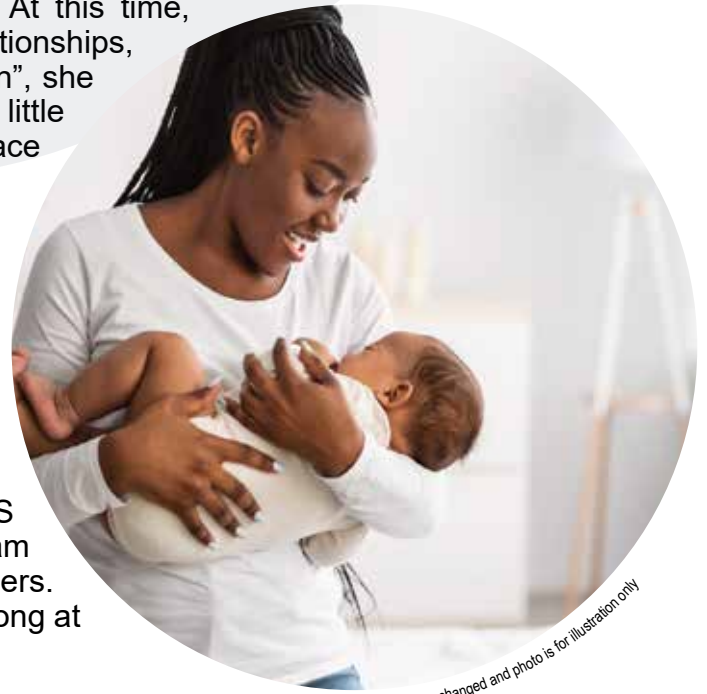
Names have been changed and photo is for illustration only