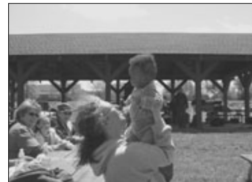
"Jesus Loves Me..."