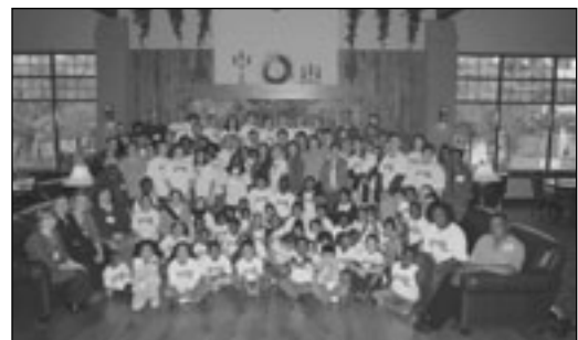
Last year's "family picture."