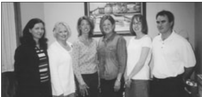
The First Green Bay Advisory Committee)

So many special relationships were formed through the years with former staff, the Green Bay Advisory Committee, the Family Fun Bowl participants and prize donors, churches and more. Thanks and GOD's blessings to each of you for the season we have had the privilege of serving on University Avenue in Green Bay, Wisconsin.